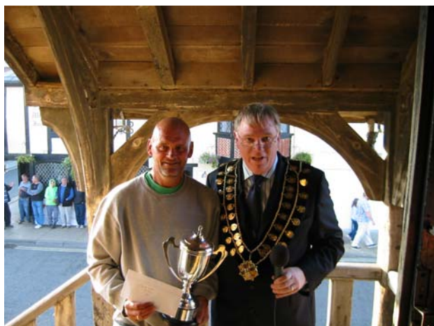
Aldeburgh Fishing Match Winner

A member from Woodbridge appreciating one of the sculptures at Woodbridge School